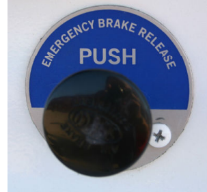
Safety brake stop