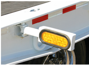
Optional swing-out flashers