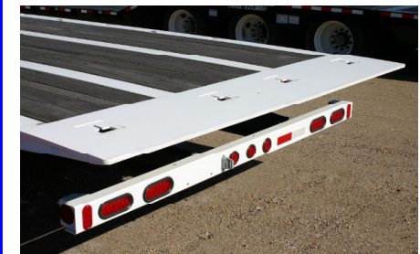
3/4" Approach for easy loading