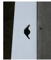
Multiple types of tie downs