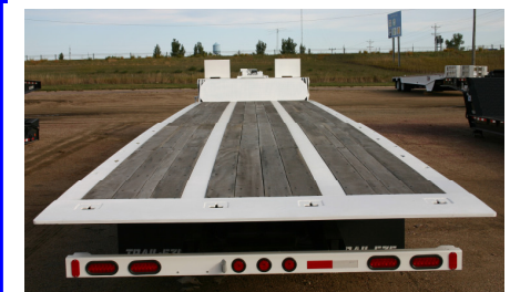
4 I-beam main frame